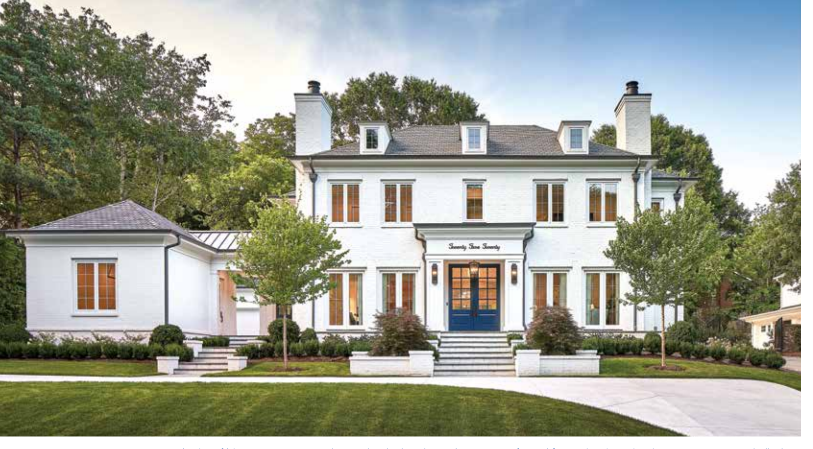
Previous pages: Varying shades of blue reign supreme in this stately Charlotte home that was transformed for modern living by designer Layton Campbell. The living room's pale pink tufted ottoman adds contrast to the blue scheme, and the dining room echoes the cool palette with plush periwinkle dining chairs. Clockwise from above: Blue notes continue throughout, beginning at the front door and continuing into the foyer with a painted blue bench. The great room's matching white Lillian August sofas pair gracefully with two ethereal paintings by artist Lauren Smith-Nagel. A gold metallic tile backsplash lends reflective glamour to the bar area, and a pair of blue armchairs reiterate the blues of the great room's paintings and throw pillows.

oised on a tree-lined street in the posh Foxcroft neighborhood of Charlotte, North Carolina, this stately home stands proudly on top of a lush green hill. At first glance, the gracious 8,000-square-foot property emanates a sense of Colonial grandeur from its well-appointed architectural presence. But a closer look at the entrance reveals a pair of striking blue doors that pop against pristine white brick—a modern touch that sets the tone for what is to unfold when one steps inside. Swathed in white, a crisp and airy interior palette comes to life in a multitude of cool blues accented with hints of coral and lilac. Updated traditional patterns, textures, metal finishes, and materials sprinkled throughout culminate to create a warm Southern welcome. The light-filled home breathes a fresh aesthetic suitable for a modern family—a feel strategically crafted via the creative nuances of designer Layton Campbell.